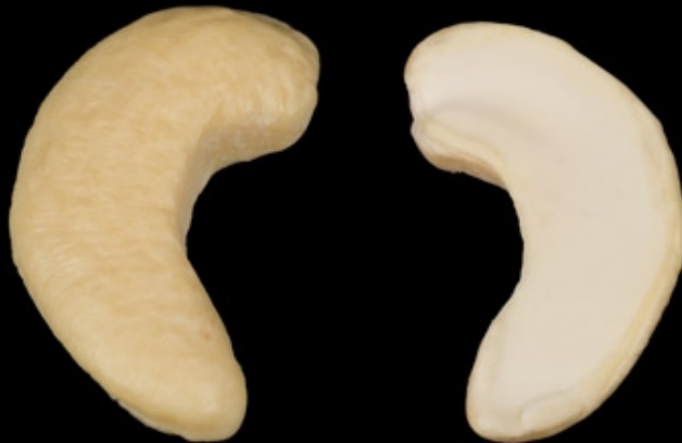
Scorched Splits (SS)