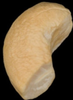
Scorched Butts (SB)